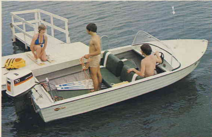
16' 3" Ski 'N' Troll F-3686-58