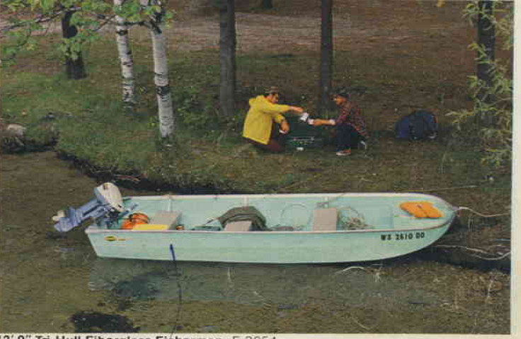
13' 9" Tri-Hull Fiberglass Fisherman F-3654