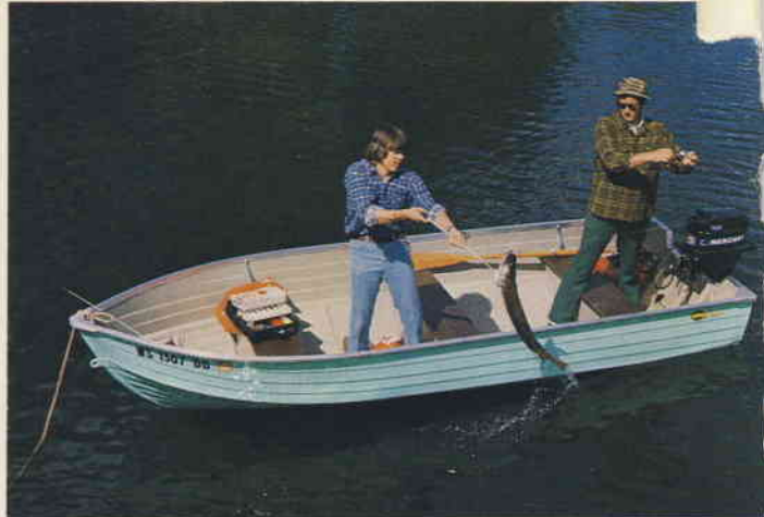
14' Deep Fisherman F-3614