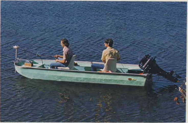
13' 9" Tri-Hull Fiberglass Bass Boat F-3654-58