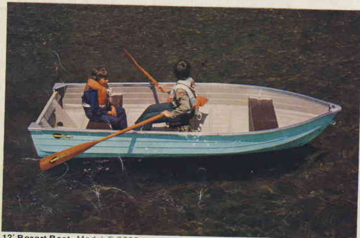
12' Resort Boat Model F-3602

Prices and comparative data subject to change without notice.