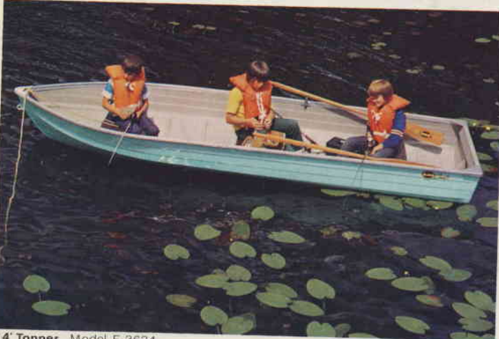
14' Topper Model F-3634