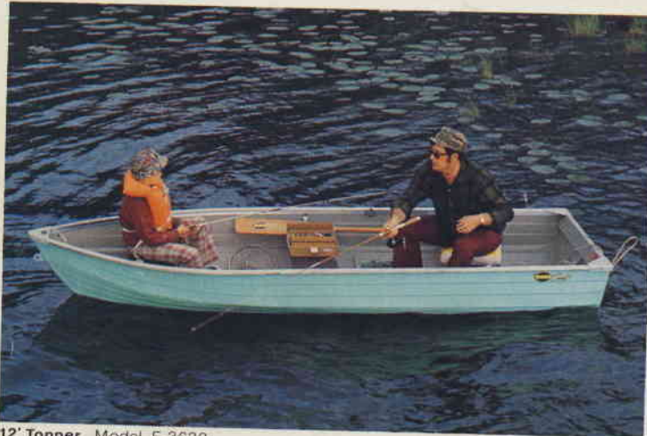
12' Topper Model F-3632