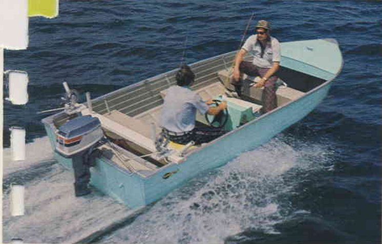
16' Lake Fisherman F-3616