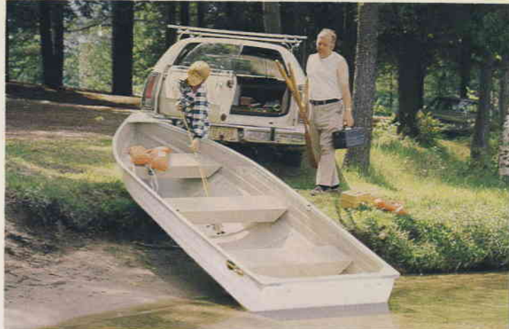
12' Economy Topper F-3652