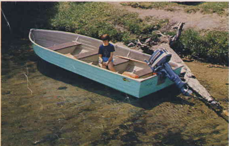
16' Deep Fisherman F-3696