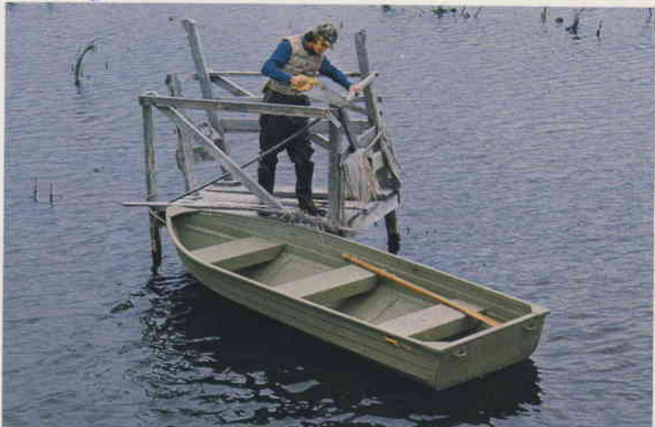
12' Economy Topper F-3652-40