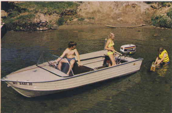
16' 3" Ski 'N' Troll F-3686-75