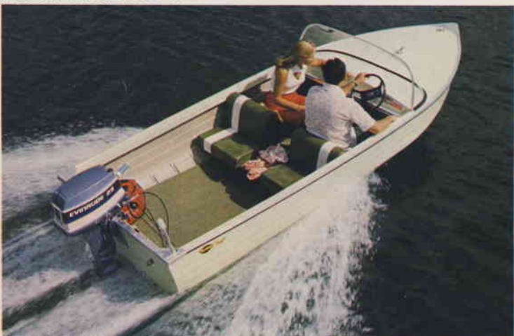
14' Ski 'N' Troll F-3624-58