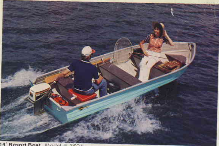
14' Resort Boat Model F-3604